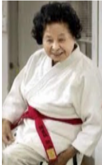
SHIHAN KEIKO FUKUDA (2011)