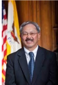
HONORABLE EDWIN LEE (2016)